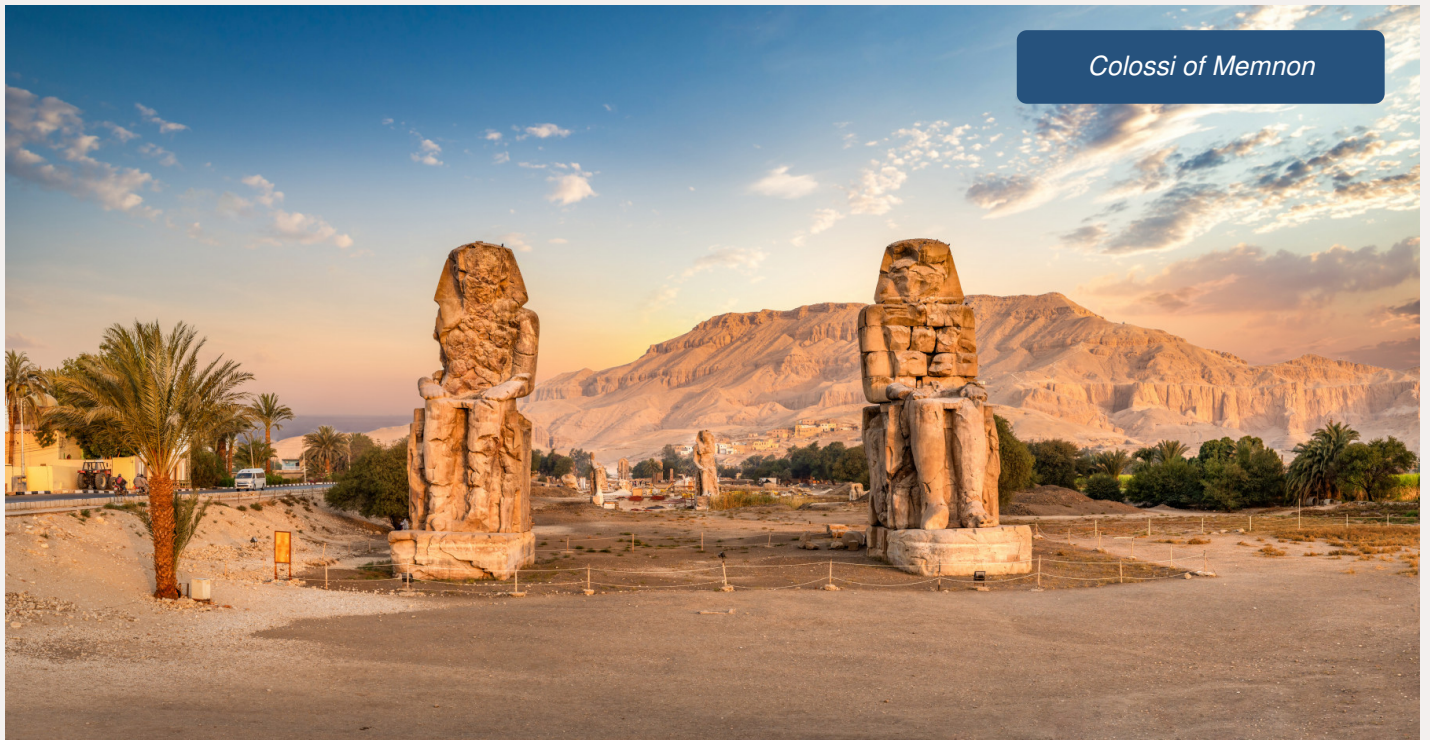
Colossi of Memnon